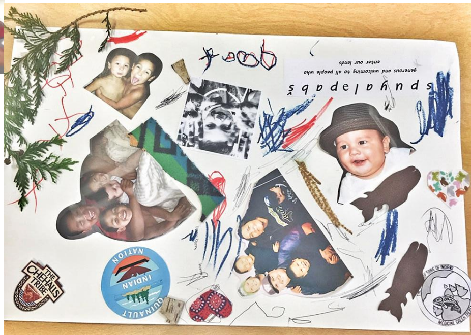
Finished identity collage