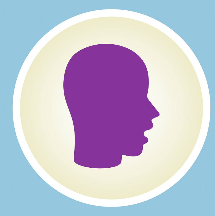
Breathing is slow or absent

Many people think an overdose always looks like a seizure. They picture someone who is shaking or foaming at the mouth like in the movies. This is often not the case. An overdose can look like: