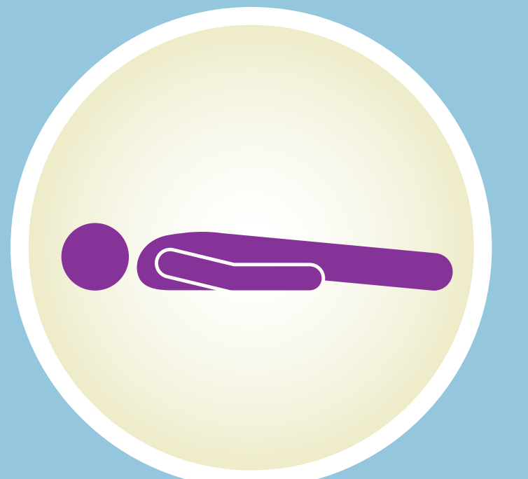
Person is not moving