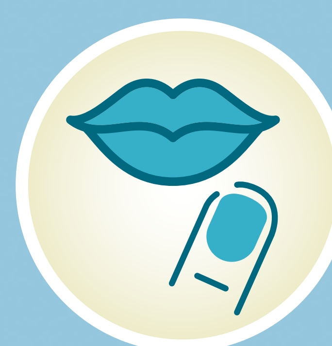
Lips and nails are blue