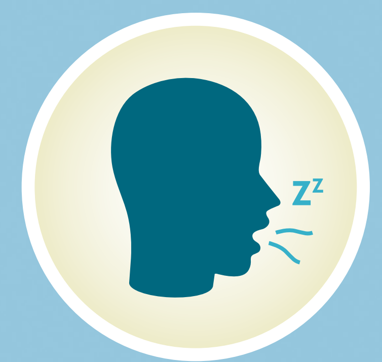
Gurgling sounds or snoring