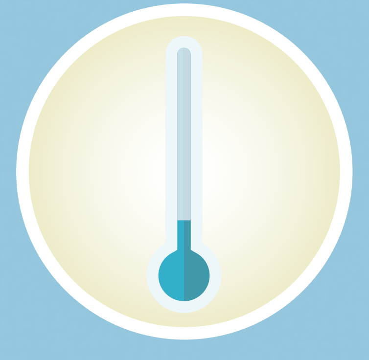
Skin feels cold and clammy