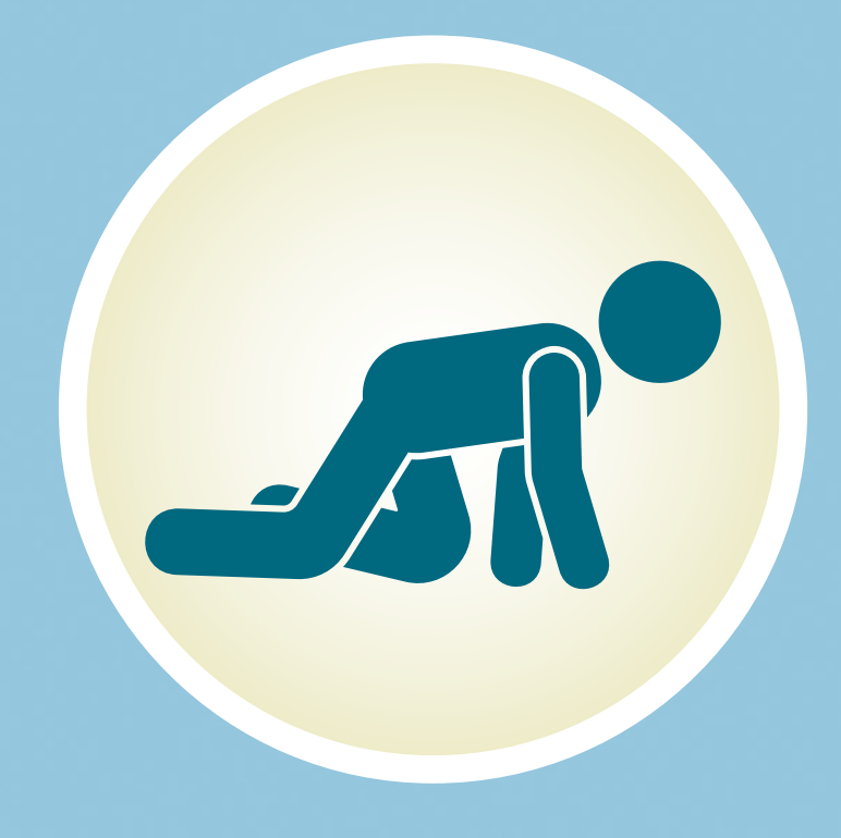
Loss of coordination (stumbling, tripping, falling down)