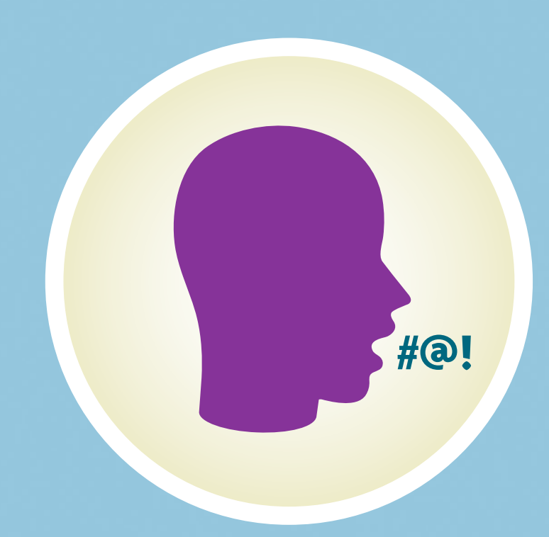
Slurred speech or not making sense