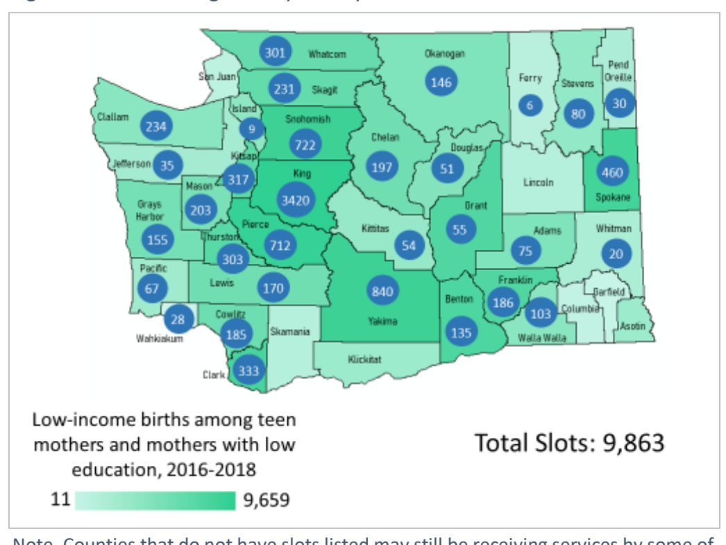
Figure 1. Home Visiting Slots by County and Need

This needs assessment measured the capability of existing home visiting programs to meet the needs identified. This included an accounting of the current capacity to serve families and an assessment of the quality of those services. The 2019 Washington Home Visiting Scan identified ten models, funding 9,863 family slots across 32 counties. In the 31 at-risk counties identified, 9,419 family slots are funded for home visiting services in 27 counties (Figure 3). Washington considered data provided by HRSA on estimated need of eligible families in the 31 at-risk counties (32,333 families) as well as an alternate estimated need of eligible families identified by Washington State (44,329 families). Washington's estimated need was represented by low-income births (Medicaid or Women, Infants, and Children Program [WIC] births from 2016-2018 as identified in Birth Certificate data) among teen mothers and mothers with low education. It is estimated that only 21% of the need identified by Washington and 29% of the need estimated by HRSA are met in 31 at-risk counties. Washington understands that the estimated need of home visiting services is not synonymous with the number of families who may choose to participate in home visiting, drawing a distinction between need estimates and potential for service expansion.