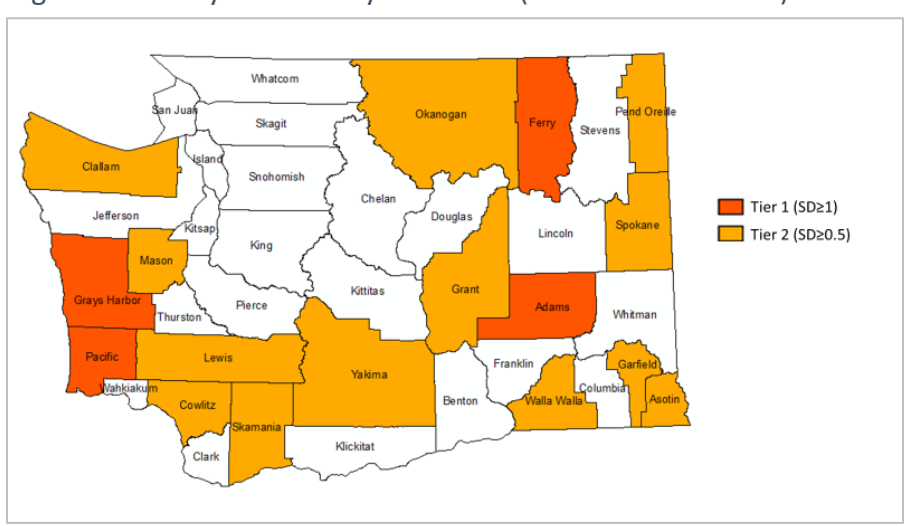
Figure 1. County-Level Analysis Results (17 At-Risk Counties)

County-level analysis identified 17 counties with elevated risk (Figure 1) while school locale-level analysis identified 30 school locales of the total 118 school locales in Washington (Figure 2), together representing 30 counties. One county (Benton) with known elevated risk was added, bringing the total at-risk counties to 31 of the 39 counties in Washington (For more details on this added county, refer to the full <a href="Need Assessment">Need Assessment</a>. Race-ethnicity analysis identified four race-ethnicity groups as the priority groups for Washington: non-Hispanic American Indian/Alaskan Native, Hispanic, non-Hispanic Black, and non-Hispanic Pacific Islander (Table 2. For more details, refer to Race-Ethnicity Brief.